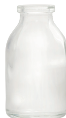
Standard molded glass vial, 20ml

EasyLylo vials show a noticeable improvement of cosmetic quality, compared to regular molded vials, thanks to a uniform thickness made possible by SGD Pharma specific technology.