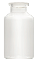
Tubular vial, 20ml