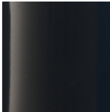
OPAQUE for simple UV protection with brand consistent coloring