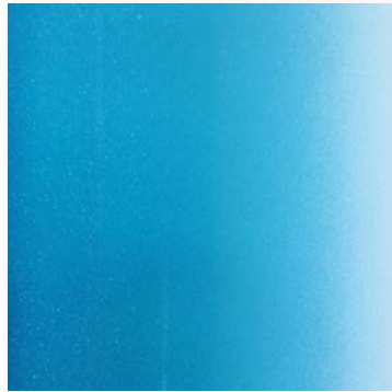
PEARLESCENCE for a timeless, high quality look