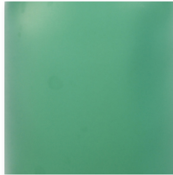
FROSTED for a soft touch finish