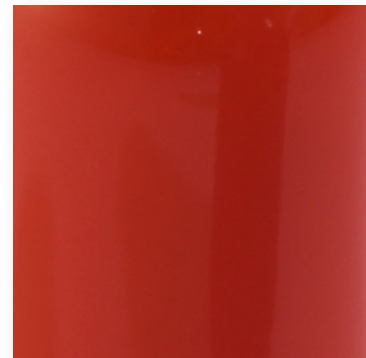
GLOSSY For an alluring finish with instant shelf appeal

Complete your packaging with screen printing or serigraphy, a stencil-based process, using 1 to 3 colors of UV ink. This is the ideal way to add decoration, further branding, directions for use and legal information. This approach eliminates any requirement for additional labels, as well as the cost and effort of applying them.