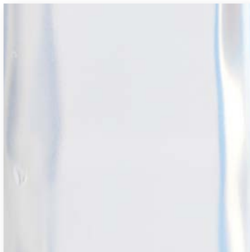
TRANSPARENT for a clean look with clear product